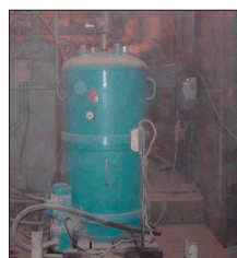
CJC™ Fine Filter HDU 427/108 installed