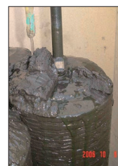
Dirty and saturated CJC™ Filter Insert