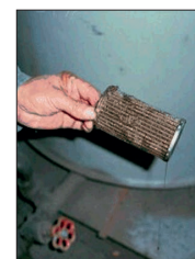
A used inline filter