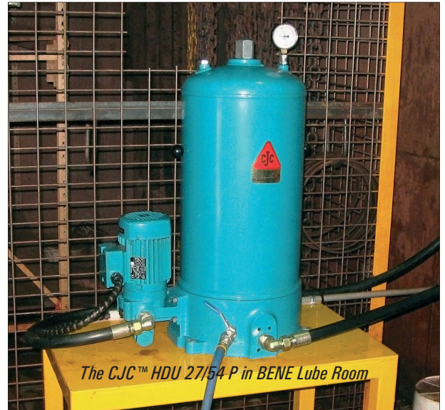
The CJC™ HDU 27/54 P in BENE Lube Room