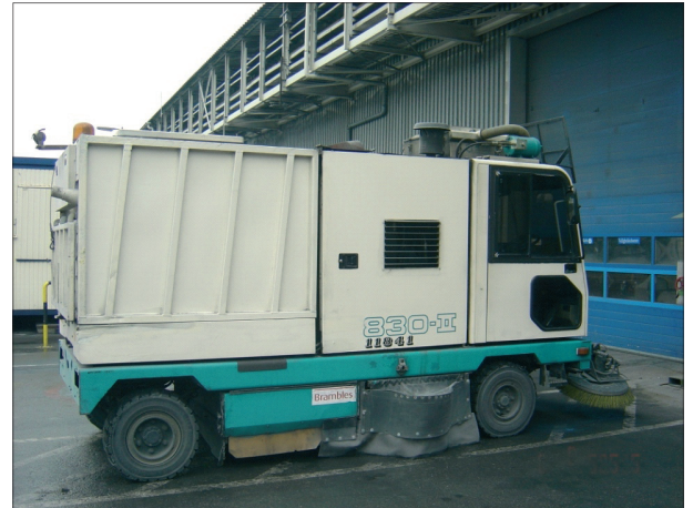
The Tennant Sentinel Street Sweeper.

Particle contamination has been tackled and ISO 16/14/11 cleanliness level was achieved within 797 running hours. The deterioration of the oil caused by resins has been arrested. The vehicle equipped with a CJC Filter is set to have an oil change after max. 5,000 hours. A longer service interval yields direct cost savings and more availability of the vehicle. Clean oil has extended the lifetime of the pumps, valves and hydro-motors.