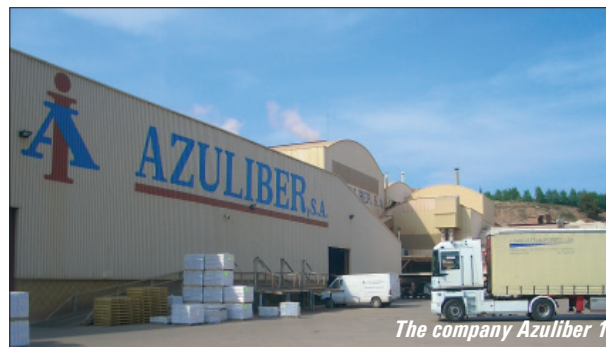
The company Azuliber 1

Oxidation by-products in the oil have also been eliminated, thus prolonging the life time of the oil and postponing replacement.