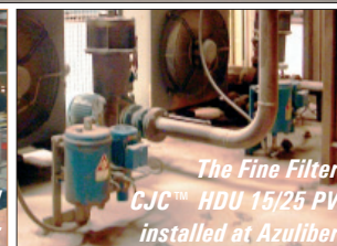
The Fine Filter CJC™ HDU 15/25 PV installed at Azuliber