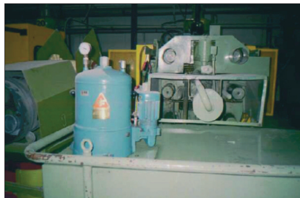
At Wavin Metalplast in Buk, Poland all STORK plastic injection moulding machines are equipped with CJC™ Fine Filters.

The filter inserts are replaced once a year.