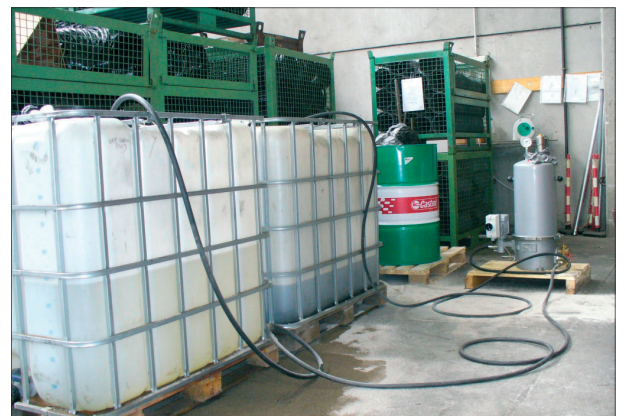
CJC™ Fine Filter HDU 27/54 MZ operating, dirty and clean oil tanks are clearly visible