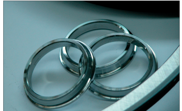
Sealing rings for hydraulic systems produced by Trelleborg Sealing Solutions in their Modena plant

Eng. Carlo Calvietti Technical Manager: "The CJC™ Fine Filter allows us to bring back the oil condition to a level comparable to or better than new oil - an important fact that guarantees a continuous high quality of our products. We also use less oil than before, achieving savings on the purchase of new oil and on the waste disposal".