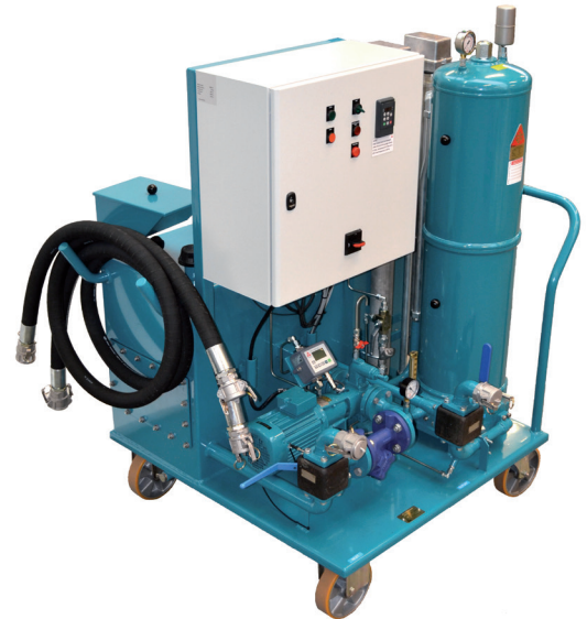
The CJC™ Mobile Flushing Unit, MFU HDU 27/108 GP