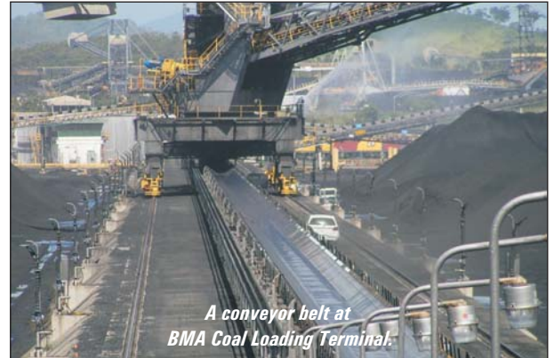
A conveyor belt at BMA Coal Loading Terminal.