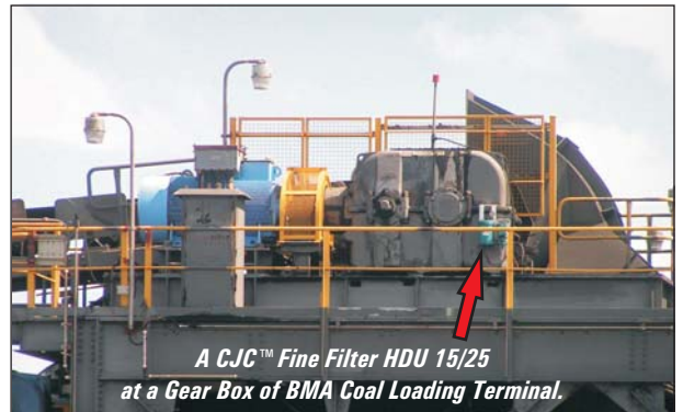
A CJC™ Fine Filter HDU 15/25 at a Gear Box of BMA Coal Loading Terminal.