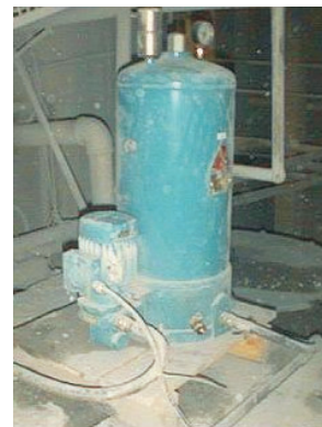
CJC™ FineFilter HDU 27/54 P-Y