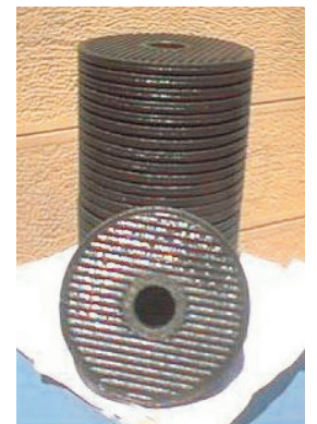
Used CJC™ FilterInsert Type B 27/27