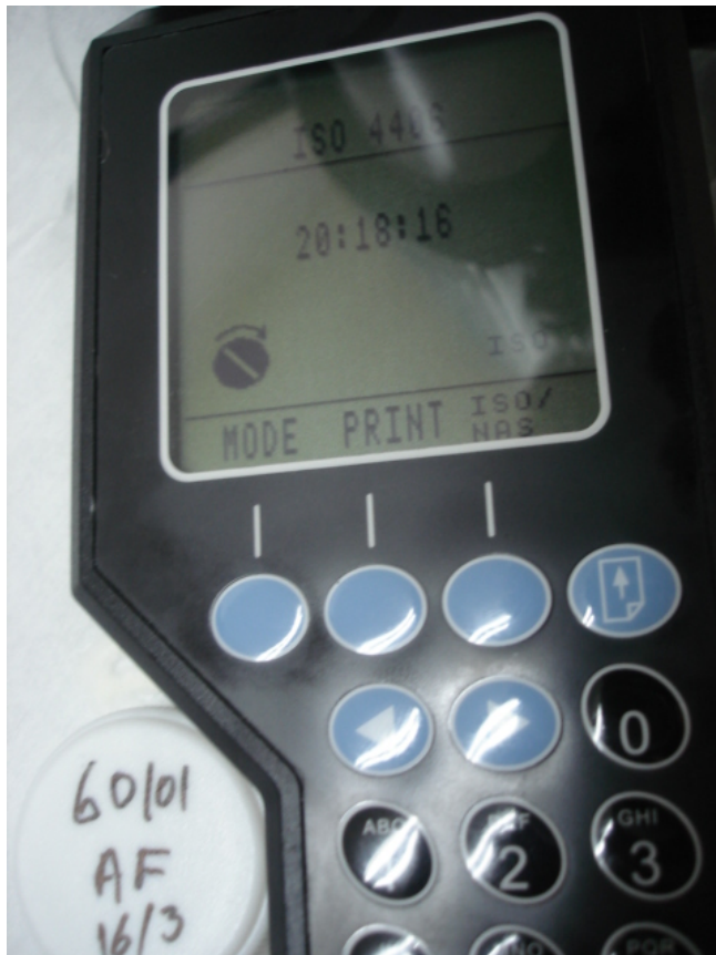
Sample AFTER CJC Filtration: 16-03-2008